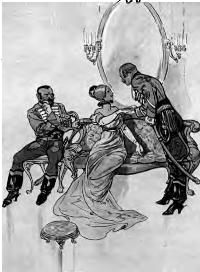
" Bowing before a sylph-like form reclining on a couch "